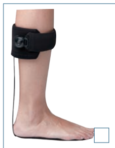
E-AFK002 Q-FIT CARBON AFO SIZE: S, M, L, XL