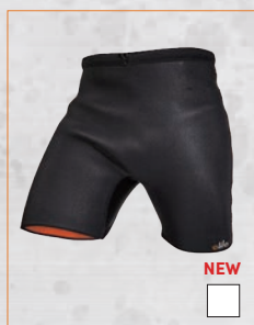
E-EPN005 THERMO SLIM SHORTS TONER