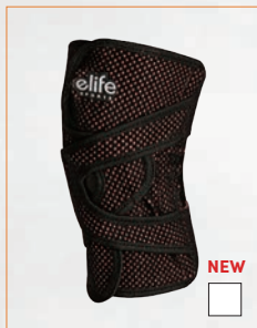
E-KNC072 COOL-FIT WRAP AROUND KNEE BRACE SIZE: S/M, L/XL