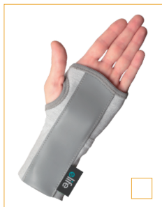
E-WR056 L/R WRIST BRACE SIZE: S, M, L, XL