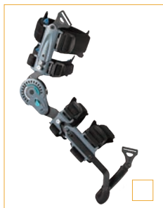
E-EL094A L/R POST-OP ELBOW BRACE WITH HAND GRIP SIZE: UNIVERSAL