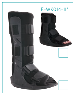
E-WK014 JEEP WALKER SIZE: XS, S, M, L, XL