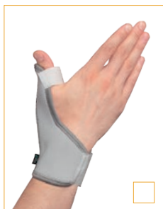
E-WR007 THUMB BRACE SIZE: S, M, L, XL