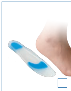
E-SI021 FULL LENGTH SILICONE INSOLE SIZE: XS, S, M, L, XL, XXL, XXXL