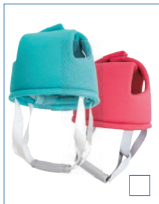
E-HM801 CRANIAL PROTECTION HELMET SIZE: UNIVERSAL