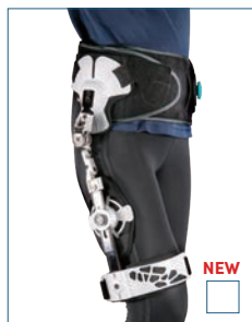
E-HP010 FAN-LITE HIP ORTHOSIS