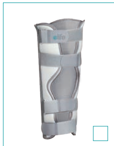
E-KN081 KNEE IMMOBILIZER SIZE: S, M, L, XL, XXL