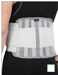
E-WA104 LUMBAR SACRO SUPPORT SIZE: S, M, L, XL, XXL