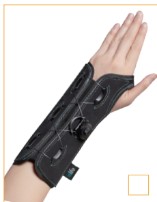
E-WRR052 L/R Q-FIT WRIST SPLINT SIZE: S, M, L, XL