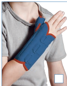
E-WR802 WRIST SPLINT WITH ABDUCTED THUMB SIZE: PEDIATRIC, YOUTH