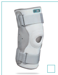
E-KN052 HINGED KNEE SUPPORT SIZE: S, M, L, XL, XXL