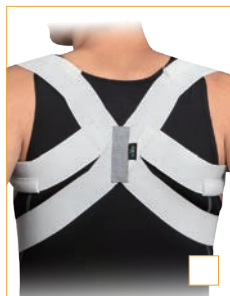
E-CL004 CLAVICLE BRACE SIZE: S, M, L, XL