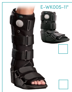
E-WK005 PNEUMATIC FIXED WALKER SIZE: S, M, L, XL