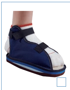
E-CA801 CAST BOOT SIZE: PEDIATRIC, YOUTH