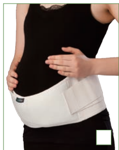
E-MB002 DELUXE MATERNITY BELT SIZE: S, M, L, XL