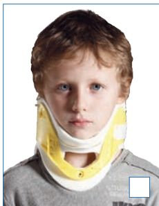
E-CO806 ADJUSTABLE COLLAR SIZE: PEDIATRIC