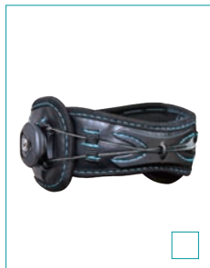
E-KNR005 Q-FIT PATELLAR STRAP SIZE: S, M, L, XL, XXL