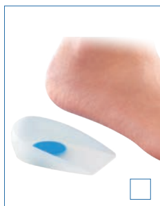
E-SI002 SILICONE HEEL CUP FOR SPURS-CENTRAL SIZE: S, M, L, XL