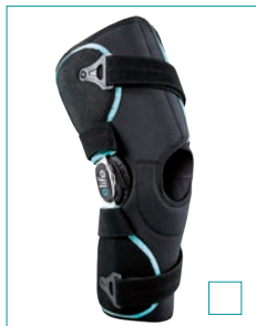
E-KN042 DAILY OA KNEE BRACE SIZE: S, M, L, XL