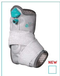
E-AN066 F.A.S.T ANKLE BRACE SIZE: S/M, L/XL