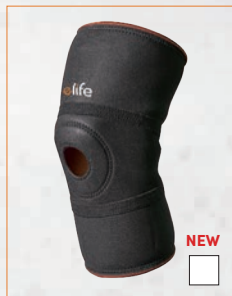
E-KNN002 THERMO KNEE BRACE