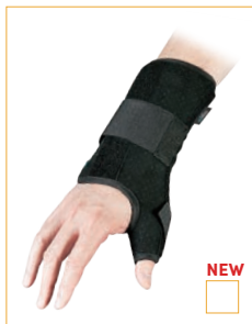
E-WR071 L/R SPICA THUMB WRIST LACER SIZE: S, M, L, XL