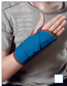
E-WR801 WRIST SPLINT SIZE: PEDIATRIC, YOUTH