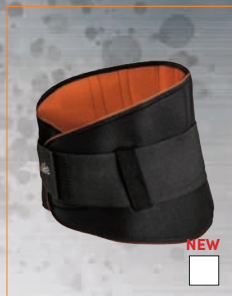
E-WAN003 THERMO LUMBAR SUPPORT