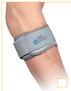
E-EL006 PADDED TENNIS ELBOW BRACE SIZE: S, M, L, XL