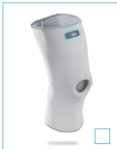
E-KN002 KNEE BRACE WITH PATELLAR OPEN SIZE: S, M, L, XL, XXL