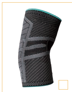
E-EL450 BIO-CONTOUR ELBOW BRACE SIZE: S, M, L, XL