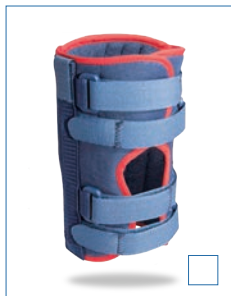
E-KN881 KNEE IMMOBILIZER SIZE: UNIVERSAL