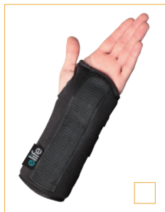
E-WR057 L/R WRIST SPLINT SIZE: S, M, L, XL