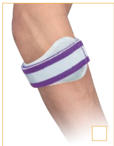
E-EL008 EPI SIZE: XS, S, M, L, XL