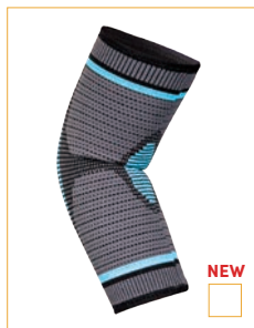
E-EL202 EPI-KNIT BRACE SIZE: S, M, L, XL