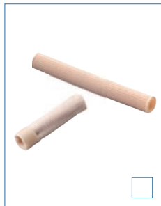
E-TS009 TUBULAR TOE BANDAGE SIZE: XS, S, M, L