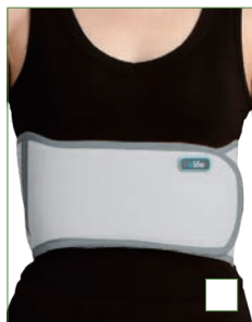
E-RB002 RIB BELT FOR WOMEN SIZE: S, M, L, XL