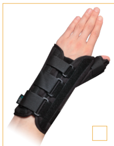
E-WR058 L/R THUMB WRIST AND PALM SPLINT SIZE: S, M, L, XL