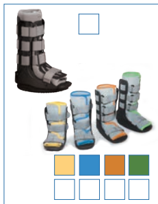
E-WK802/E-WK802B WALKING BOOT SIZE: S, M, L, XL