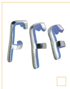
E-FS001 BASEBALL FINGER SPLINT SIZE: S, M, L