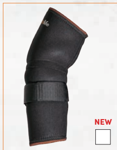
E-ELN003 THERMO ELBOW SUPPORT SIZE: S, M, L, XL