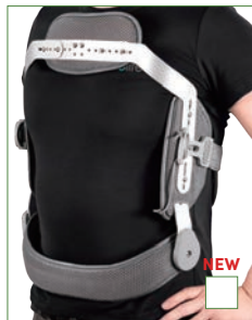
E-HE001E HYPEREXTENSION BRACE SIZE: S, M, L, XL