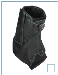
E-ANR043 Q-FIT ANKLE BRACE