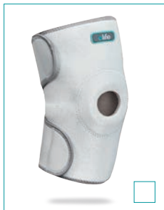
E-KN004 OPEN PATELLAR KNEE BRACE SIZE: UNIVERSAL