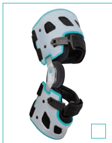
E-KN040 OA KNEE STANDARD SIZE: UNIVERSAL