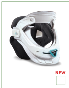
E-CO007B ARMOUR CERVICAL COLLAR SIZE: UNIVERSAL