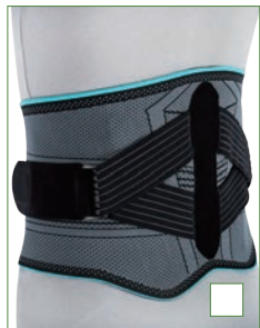
E-WA401 BIO-CONTOUR BACK BRACE WITH STRAP SIZE: S, M, L, XL, XXL