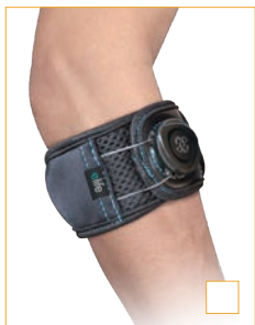
E-ELR006 Q-FIT ELBOW BRACE SIZE: S, M, L, XL