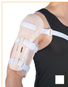
E-SH006 OVER SHOULDER HUMERAL SPLINT SIZE: S, M, L, XL