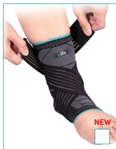
E-AN451 BIO-CONTOUR ANKLE BRACE WITH STRAP SIZE: S, M, L, XL