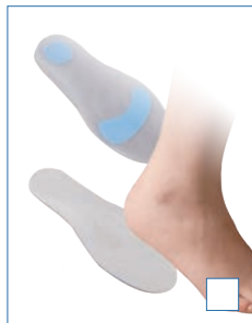
E-SI121 FULL LENGTH INSOLE WITH FABRIC SIZE: XS, S, M, L, XL, XXL, XXXL