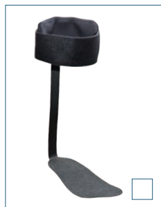
E-AFK001 X1 CARBON AFO SIZE: S, M, L, XL