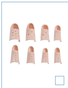
E-FS006 MALLET FINGER SPLINT SIZE: 1, 2, 3, 4, 5, 5.5, 6, 7