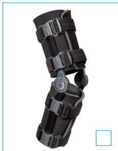
E-KN099B FULL FOAM KNEE BRACE SIZE: UNIVERSAL