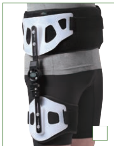
E-HP009 LITE HIP BRACE SIZE: UNIVERSAL