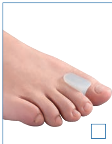
E-TS003 TOE SEPARATOR SIZE: S, M, L