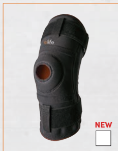
E-KNN003 THERMO KNEE SUPPORT