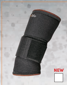
E-WRN002 THERMO WRIST BRACE