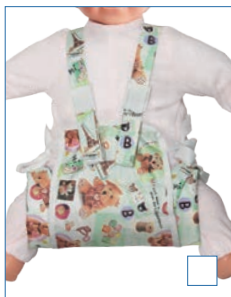
E-PH802 FREJKA SPLINT SIZE: XS, S, M, L, XL, XXL