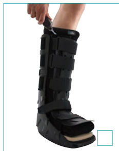
E-WK009D DIABETIC WALKER SIZE: S, M, L, XL