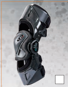
L/R E-KNK035A L/R X1 KNEE BRACE WITH CUP