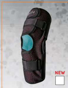
E-KNC058 COOL-FIT WRAP KNEE SUPPORT SIZE: S/M, L/XL