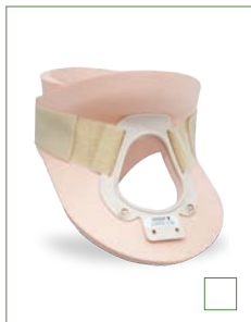
E-CO002A CERVICAL COLLAR WITH TRACHEA OPENING SIZE: S, M, L, XL