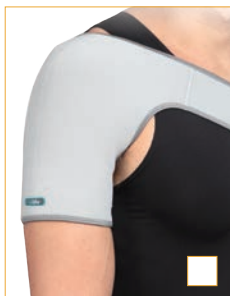
E-SH001 NEOPRENE SHOULDER SUPPORT SIZE: S, M, L, XL