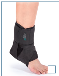
E-AN043B ANKLE BRACE WITH STRAP