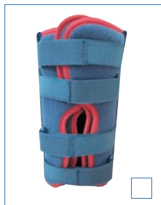
E-KN882 KNEE IMMOBILIZER/ 3 PANELS SIZE: UNIVERSAL