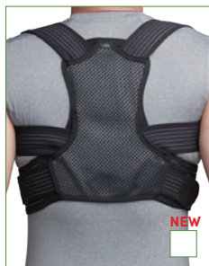
E-CL007 ADJUSTABLE POSTURE CORRECTOR SIZE: S, M, L, XL