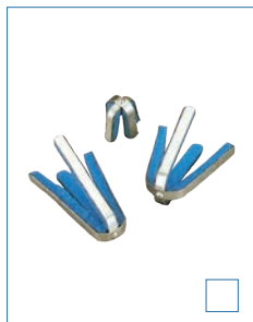
E-FS004 FOUR PRONG FINGER SPLINT SIZE: S, M, L