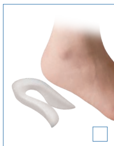
E-SI007 "U" SHAPE HEEL PAD SIZE: S, M, L