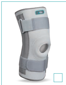
E-KN070 STABILIZED KNEE SUPPORT SIZE: S, M, L, XL, XXL