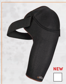
E-SHN002 THERMO SHOULDER BRACE SIZE: S, M, L