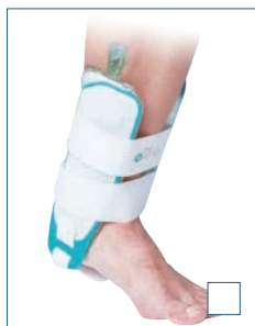
E-AN065 D1 STIRRUP BRACE SIZE: UNIVERSAL