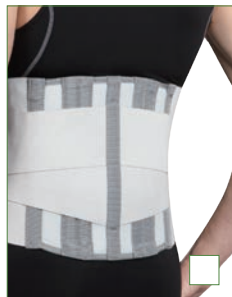
E-WA106 LUMBAR SACRO SUPPORT SIZE: S, M, L, XL, XXL