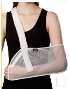
E-AR003 MESH ARM SLING SIZE: S, M, L, XL