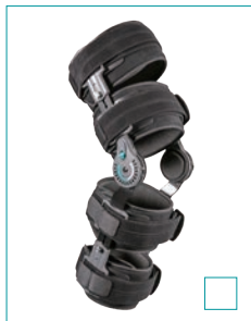
E-KN099C COOL FOAM KNEE BRACE SIZE: UNIVERSAL