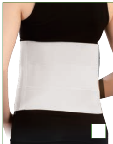
E-WA052 ABDOMINAL BINDER/ 3 PANELS SIZE: S, M, L, XL, XXL