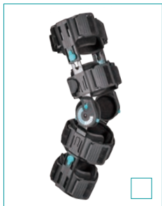
E-KN098 SETTER KNEE BRACE SIZE: UNIVERSAL