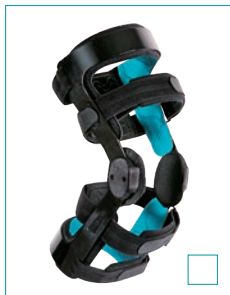
E-KN034 FUNCTIONAL KNEE BRACE SIZE: S, M, L, XL