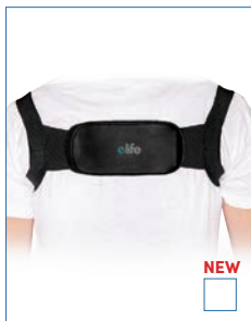
E-CL803 POSTURE CORRECTOR SIZE: UNIVERSAL