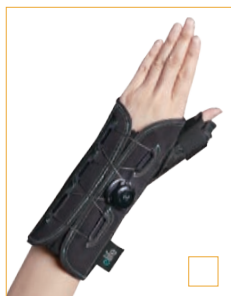
E-WRR058 L/R Q-FIT THUMB AND WRIST SPLINT SIZE: S, M, L, XL