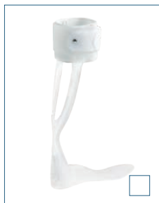
E-AF002 AFO LEAF SPRING SIZE: S, M, L, XL