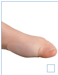
E-TS005 BUNION SHIELD WITH LOOP SIZE: S/M, L/XL