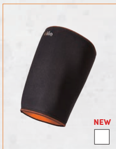
E-THN002 THERMO THIGH BRACE SIZE: S, M, L, XL