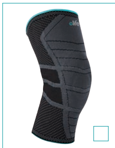
E-KN450 BIO-CONTOUR KNEE BRACE SIZE: S, M, L, XL