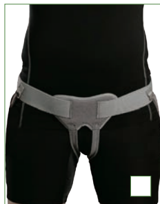
E-HB002 HERNIA BELT SIZE: S, M, L, XL