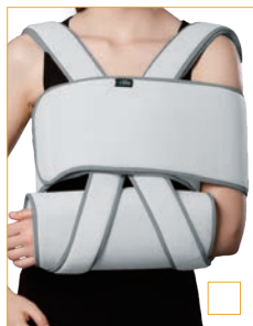
E-AR007 SHOULDER SLING SIZE: UNIVERSAL