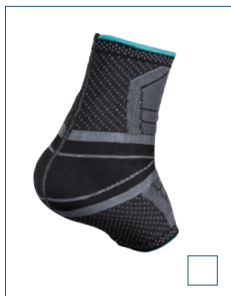
E-AN450 BIO-CONTOUR ANKLE BRACE