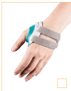
E-WR009 CMC GUIDER SIZE: S, M, L