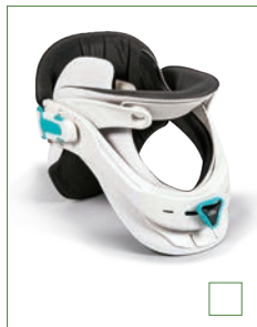
E-CO007 ARMOUR CERVICAL COLLAR SIZE: UNIVERSAL