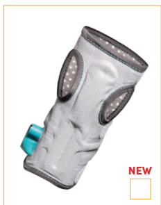
E-WR067 F.A.S.T WRIST SPLINT SIZE: S, M, L