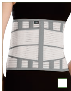
E-WA110 LUMBAR SACRO SUPPORT SIZE: S, M, L, XL, XXL