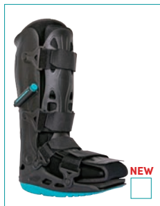
E-WK018 TRANS 2 WALKER SIZE: S, M, L, XL