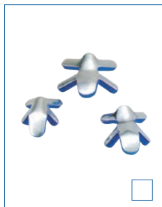
E-FS002 TOAD FINGER SPLINT SIZE: S, M, L