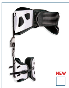
E-HP011 ADJUSTABLE HIP ORTHOSIS