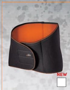
E-WAN002 THERMO LUMBAR BRACE