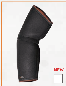
E-ELN002 THERMO ELBOW BRACE SIZE: S, M, L, XL