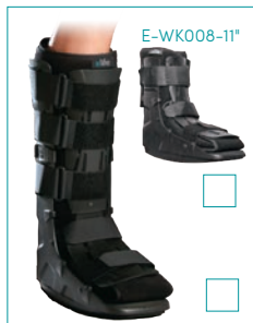
E-WK008 PRO SHIELD WALKER SIZE: S, M, L, XL