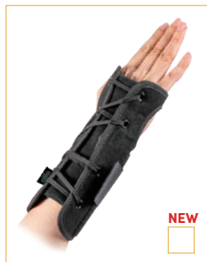
E-WR072 WRIST LACER SIZE: S/M, L/XL