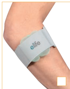
E-EL005 PNEUMATIC ELBOW BRACE SIZE: UNIVERSAL