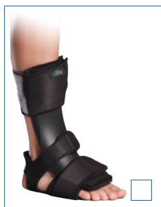
E-NS003 DORSAL NIGHT SPLINT SIZE: S/ M, L/ XL