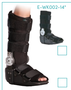
E-WK002 ROM WALKER SIZE: S, M, L, XL