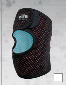
E-KNC051 COOL-FIT KNEE BRACE SIZE: S/M, L/XL