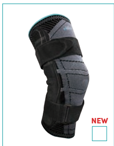
E-KN057 UNI FIT ROM KNEE SUPPORT SIZE: UNIVERSAL