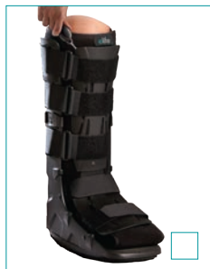
E-WK009 PRO SHIELD PNEUMATIC WALKER SIZE: S, M, L, XL