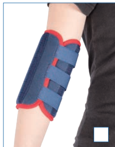
E-EL881 ELBOW IMMOBILIZER SIZE: PEDIATRIC, YOUTH