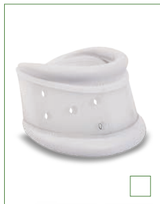
E-CO003 RIGID ADJUSTABLE COLLAR SIZE: S, M, L, XL