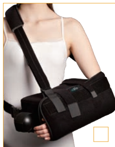
E-AR011 SHOULDER IMMOBILIZER WITH ABDUCTION SIZE: S, M, L, XL