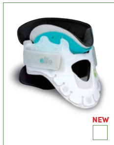
E-CO010 OB COLLAR SIZE: Pediatric, S, M, L, XL