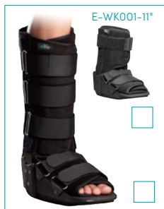
E-WK001 FIXED WALKER SIZE: S, M, L, XL