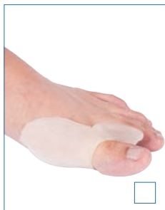
E-TS014 FOOT -BUNION SEPARATOR SIZE: S/M, L/XL