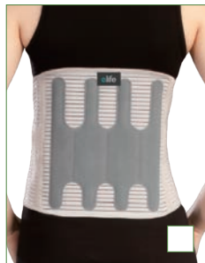
E-WA011 FIT LUMBAR SUPPORT SIZE: S, M, L, XL, XXL