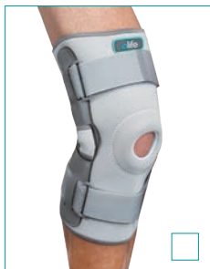
E-KN051 HINGED KNEE SUPPORT SIZE: S, M, L, XL, XXL