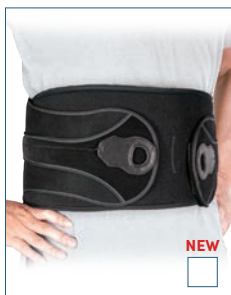
E-WA027 APS COMBO BACK