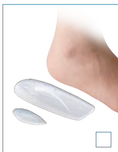
E-SI005 HEEL CUSHION SIZE: S, M, L