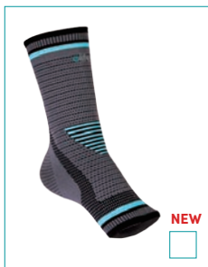
L/R E-AN202 MALLEO-KNIT BRACE SIZE: S, M, L, XL