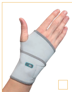
E-WR002 WRIST BRACE SIZE: UNIVERSAL