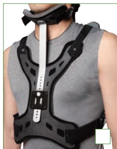
E-CH004 CERVICAL THORACIC ORTHOSIS SIZE: UNIVERSAL