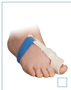
E-HV001 L/R BUNION NIGHT SPLINT SIZE: S, M, L