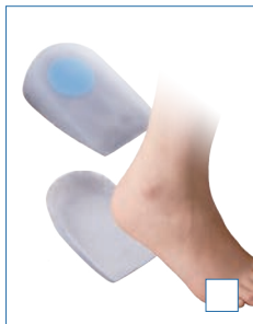
E-SI102 HEEL CUP WITH FABRIC SIZE: S, M, L, XL