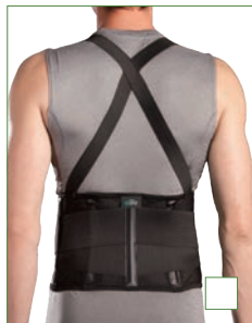
E-WA004 INDUSTRIAL BACK SUPPORT SIZE: S, M, L, XL