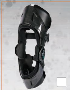
E-KNK035 X1 KNEE BRACE