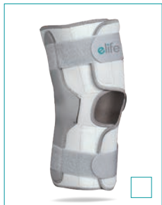
E-KN058 WRAP AROUND HINGED KNEE SUPPORT SIZE: S, M, L, XL, XXL