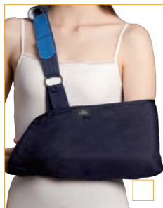
E-AR002 SHOULDER IMMOBILIZER SIZE: S, M, L, XL