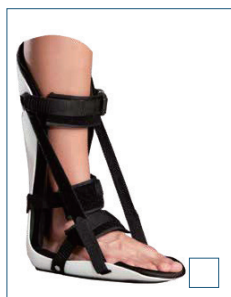
E-NS001 PLANTAR FASCIITIS STRETCH SPLINT SIZE: S, M, L