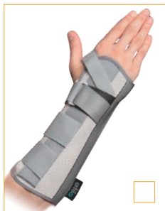
E-WR053 L/R WRISTLET WITH FOREARM SPLINT SIZE: S, M, L, XL