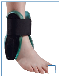
E-AN860 AIR / GEL STIRRUP ANKLE BRACE SIZE: PEDIATRIC