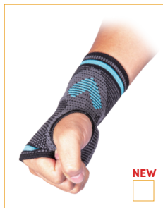
E-WR204 MANU-KNIT BRACE SIZE: S, M, L, XL