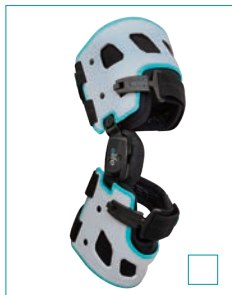
E-KN041 OA KNEE SHELTER SIZE: UNIVERSAL