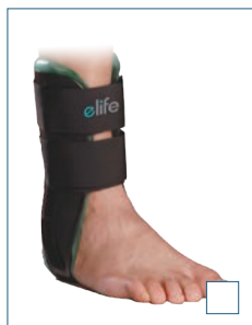
E-AN060 AIR / GEL ANKLE BRACE SIZE: UNIVERSAL