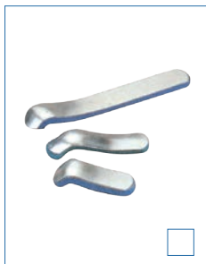
E-FS003 GUTTER FINGER SPLINT SIZE: S, M, L