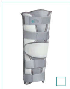
E-KN081A KNEE IMMOBILIZER WITH PATELLAR STRAP SIZE: S, M, L, XL, XXL