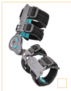
E-EL094 L/R POST-OP ELBOW BRACE SIZE: UNIVERSAL