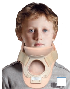
E-CO802A CERVICAL COLLAR WITH TRACHEA OPENING SIZE: PEDIATRIC