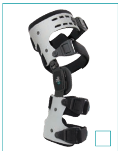
E-KN036 UNLIMIT S1 OA KNEE BRACE SIZE: UNIVERSAL