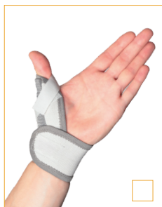
E-WR050 WRISTLET WITH ABDUCTED THUMB SLEEVE SIZE: S, M, L, XL