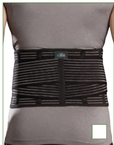
E-WA003 BACK SUPPORT SIZE: S, M, L, XL, XXL