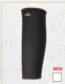
E-SNN002 THERMO CALF BRACE SIZE: S, M, L, XL