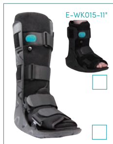
E-WK015 PNEUMATIC JEEP WALKER SIZE: XS, S, M, L, XL