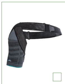
E-SH450 BIO-CONTOUR SHOULDER BRACE SIZE: S, M, L, XL