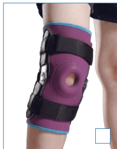
E-KN851 NEOPRENE HINGED KNEE SUPPORT SIZE: PEDIATRIC, YOUTH