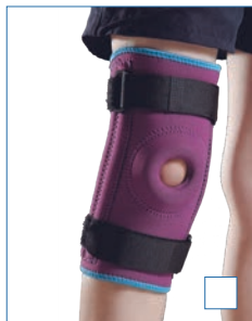
E-KN870 NEOPRENE STABILIZED KNEE SUPPORT SIZE: PEDIATRIC, YOUTH