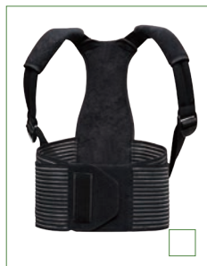
E-WA120 OSTEOPOROSIS BRACE SIZE: S/M, L/XL