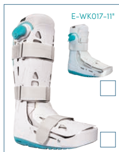
E-WK017 D1 WALKER WITH AIR CUSHIONED OUTSOLE SIZE: S, M, L, XL