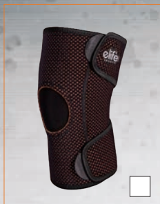
E-KNC001 COOL-FIT WRAP KNEE SUPPORT SIZE: UNIVERSAL