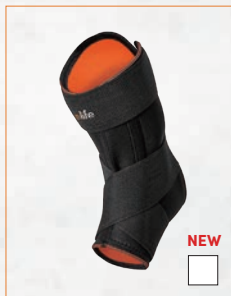
E-ANN003 THERMO ANKLE SUPPORT