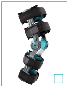
E-KN099 DELUXE KNEE BRACE SIZE: UNIVERSAL