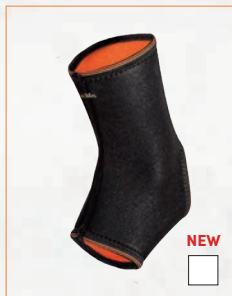
E-ANN002 THERMO ANKLE BRACE