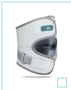
E-KN006 PATELLAR TENDON BRACE SIZE: S, M, L, XL, XXL