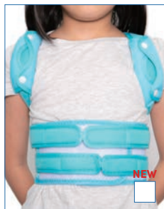
E-CL804 POSTURE CORRECTOR SIZE: S, M, L, XL