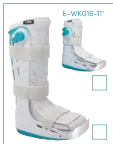
E-WK016 D1 WALKER SIZE: S, M, L, XL