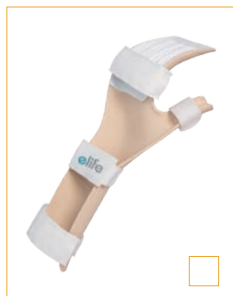
E-WR123 L/R FUNCTIONAL RESTING SPLINT SIZE: S, M, L, XL