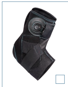
E-ANR045 Q-FIT ANKLE STABILIZER