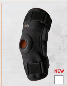
E-KNN051 THERMO HINGED KNEE SUPPORT