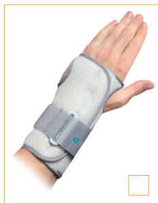
E-WR063 WRIST BRACE SIZE: S, M, L, XL