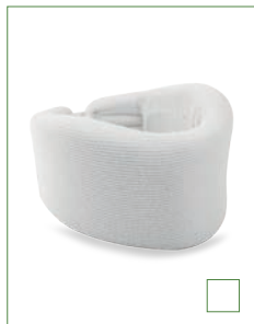
E-CO001/004 FOAM CERVICAL COLLAR/FIRM DENSITY COLLAR SIZE: XS, S, M, L, XL