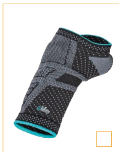
E-WR450 BIO-CONTOUR WRIST BRACE SIZE: S, M, L, XL