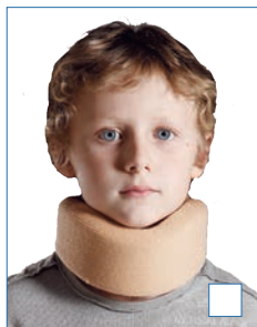
E-CO801 SOFT FOAM COLLAR SIZE: YOUTH