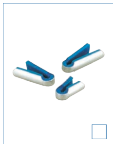
E-FS005 FOLD-OVER FINGER SPLINT SIZE: S, M, L