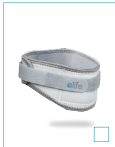
E-KN005 PATELLAR STRAP SIZE: UNIVERSAL