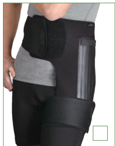
E-HP008 HSO HIP SUPPORT L/R SIZE: S, M, L, XL