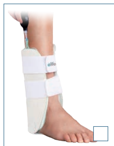
E-AN055B AIR ANKLE STIRRUP BRACE SIZE: UNIVERSAL