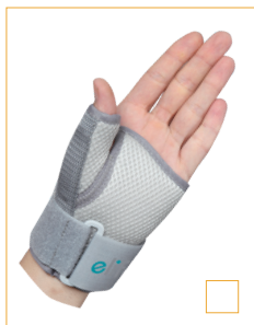
E-WR060 L/R WRIST BRACE WITH THUMB SIZE: S, M, L, XL