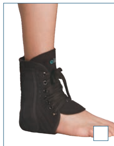
E-AN051 LACED ANKLE BRACE