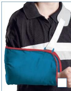
E-AR801 ARM SLING WITH PAD SIZE: PEDIATRIC, YOUTH