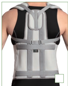
E-WA113 DORSAL LUMBAR BACK SUPPORT SIZE: S, M, L, XL, XXL