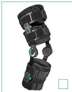
E-KN097B POST OP KNEE BRACE SIZE: UNIVERSAL