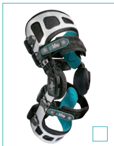
E-KN038 CONQUER OA KNEE BRACE SIZE: S, M, L, XL