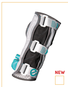
E-WR066 F.A.S.T WRIST BRACE SIZE: S, M, L