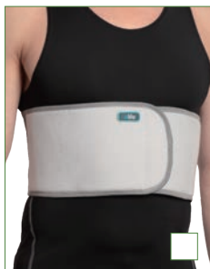
E-RB001 RIB BELT FOR MEN SIZE: S, M, L, XL