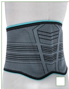
E-WA450 BIO-CONTOUR BACK BRACE SIZE: S, M, L, XL, XXL