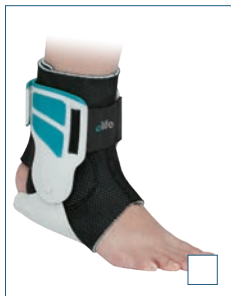
E-AN064 DYNAMIC ANKLE SHELTER